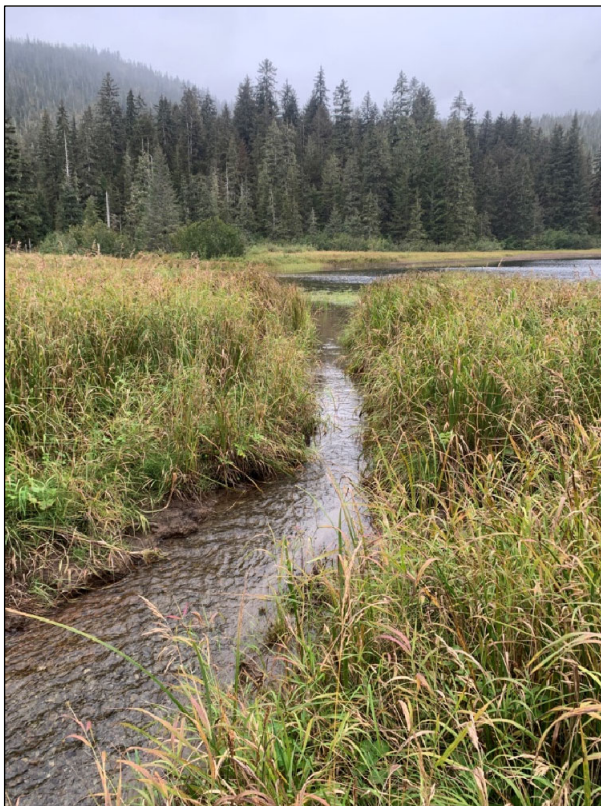
Figure 2.—Downstream view of channel towards lake at waypoint 1778.