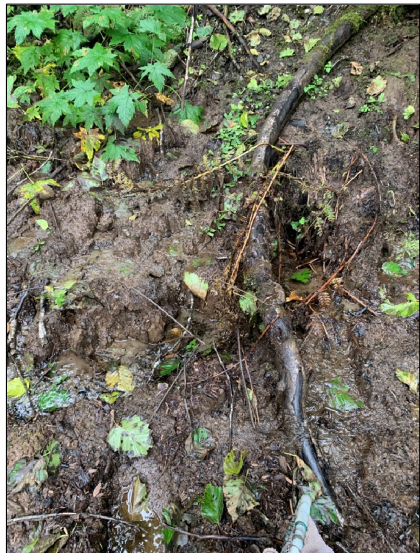
Figure 3.—Stream seeping out of hillside at waypoint 1780.