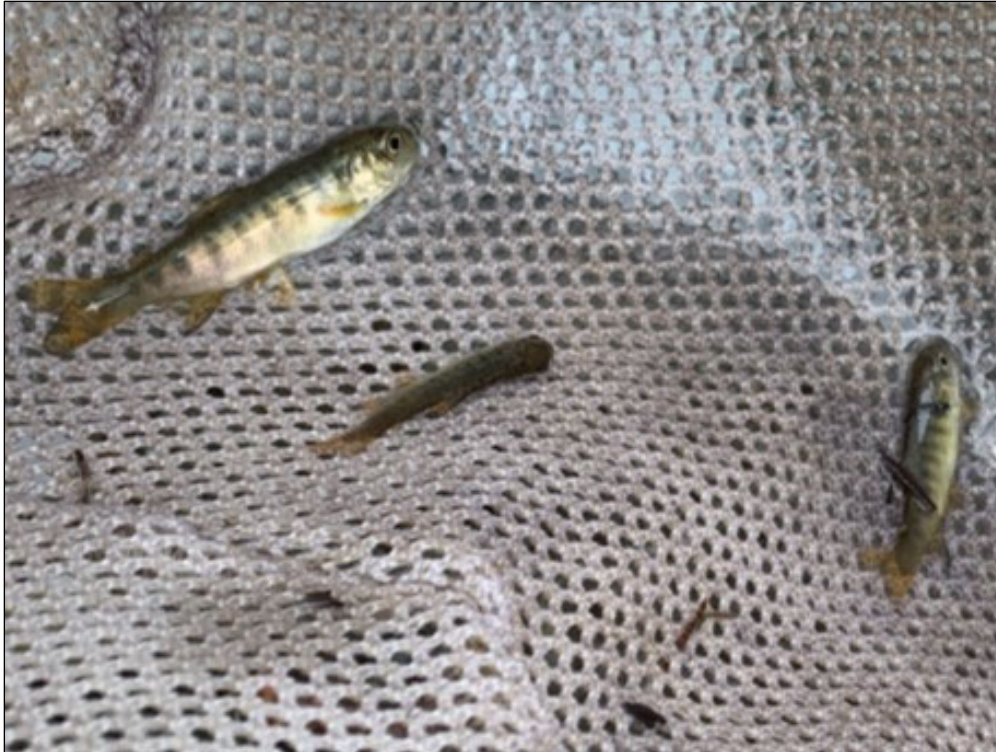
Figure 1.—Juvenile coho salmon captured at waypoint 1779.